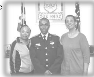
Board Members & 2016 Woodlawn Officer of Yr